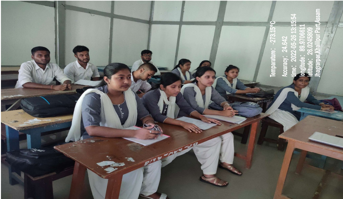
Students Attending the Seminar