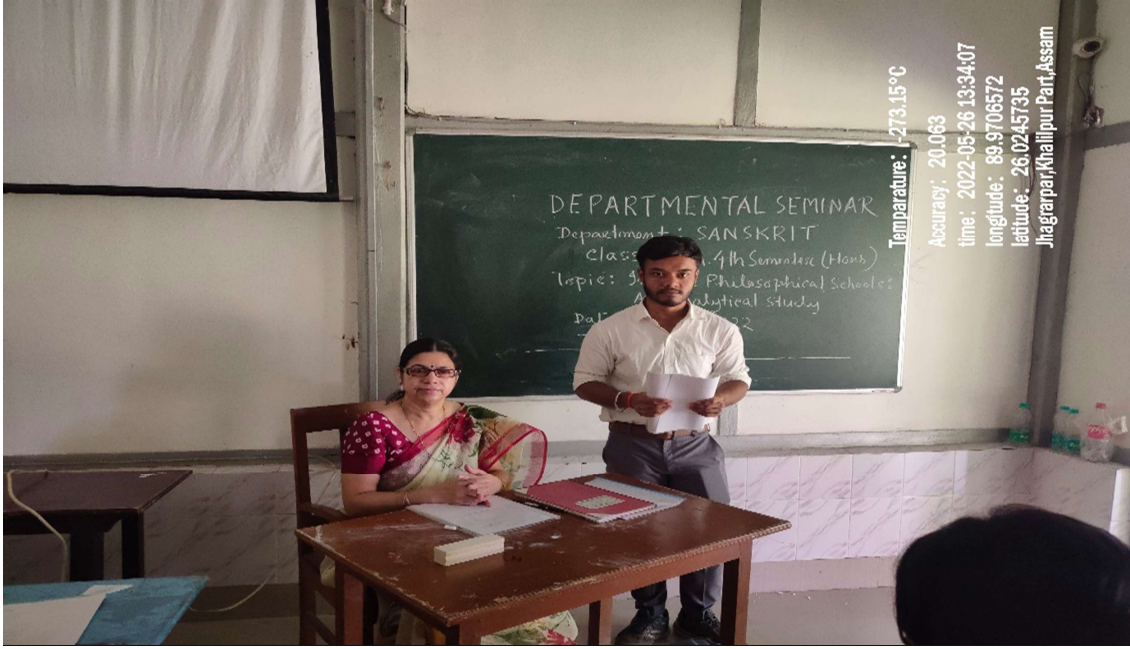
A Student of B. A. 4 th Semester Honours presenting his Paper